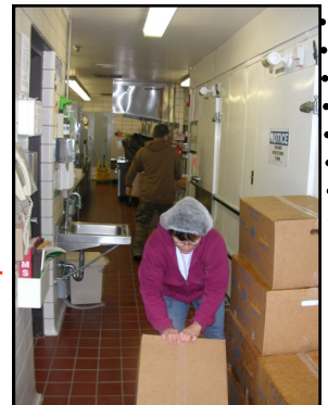
Darke County Home staff sort through a “Feeding America” food from GSH.

“Whatever you did for the least of these, brothers of mine, you did for me.” Matthew 25.40