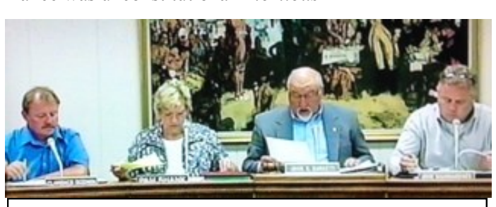
Council members vote 6-1 to repeal 2010 ordinance intended to curtail GSH ministry in Greenville.

All we can say is what Joseph said to his brothers who tried to kill him. "You meant it for evil, but God meant it for good."